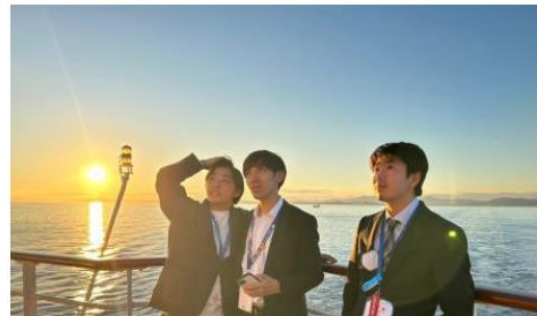
Sunset view from the Nippon Maru