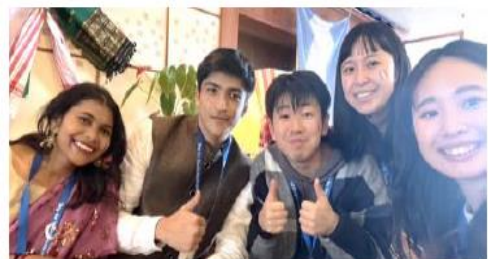
With the Youth Delegation

Your first step towards a challenge will change you and create your future.