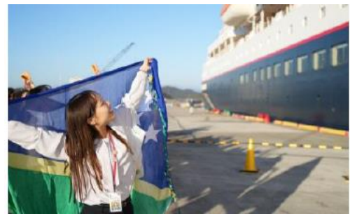
Seeing off the "Nippon Maru" at Kochi New Port

In February 2024, the "Ship for World Youth" local practice activities (Kochi Prefecture Program) suddenly came my way. Despite never having participated in the "Ship for World Youth" program, I was appointed as the Deputy Executive Committee Chairperson for its reception. Over the years, I had transitioned from being the one nurtured to supporting the growth of the youth.